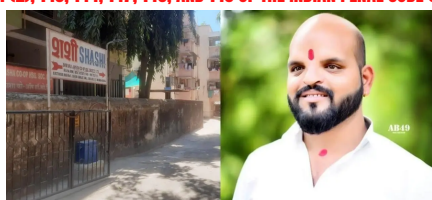
on Carter Number 5, Kasturba Marg Borivali East.

According to the police sources, they received three calls from police control between 1:20 am to 1:30 am. Two calls from locals that they had caught suspect thieves and the third call was about a lynching incident that took place near the three buildings - Sashi, Akash, and Borivali Bindwasni located